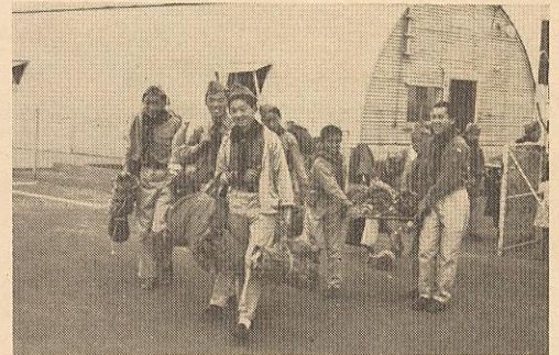
THE CAMPING EQUIPMENT which these Lanai Boy Scouts are carrying, tells us that they are enroute to a week's outing. As members of Packs 24 and 124, they flew to the Big Island for the outing.