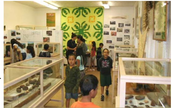
Students of Lāna'i High & Elementary School learn their island history at the Lāna'i CHC (2008).