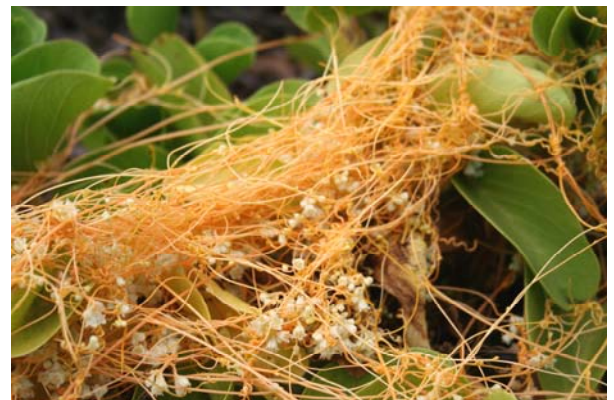
Kauna'oa lei ( Cuscuta Sandwichiana ), the beautiful and now rare flower of Lāna'i, "worn like a feather cloak upon one's shoulders."