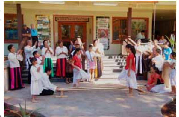
Members of Lāna‘i’s Filipino Community shared folk dances and music, and celebrated more than 80 years of contributions to Lāna‘i’s history.