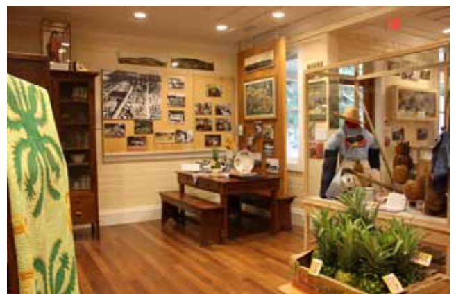
Plantation Heritage Room at the new Lāna‘i CHC.

The Lāna‘i CHC organized as a community non-profit foundation in 2007. In 2009, 5,029 residents and visitors participated in programs of the center. Programs included work with Lāna‘i students; service projects with island residents, visitors and national education/resource