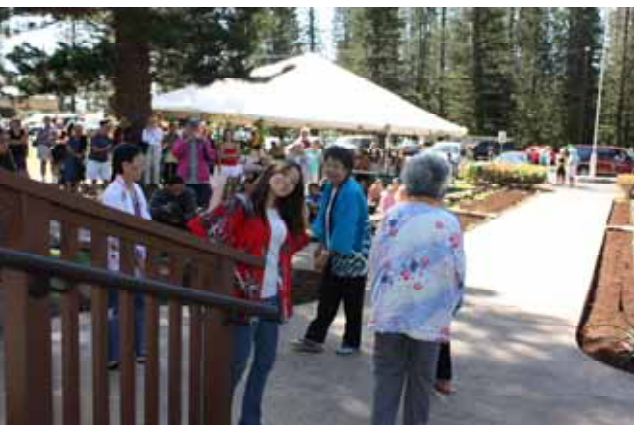
Ladies of the Lāna‘i Hongwanji Mission shared an old Japanese folk dance and mochi rice treats with the audience as a part of the opening events.

Another challenge is funding. If we are to ensure that the history of Lāna‘i’s families will be remembered and passed on, we need to be able to fund operation of the Lāna‘i CHC—including staff support, utilities, and continued development of the archival collections and exhibits. In these days of challenging economic issues, it is difficult to think about supporting efforts like the Lāna‘i CHC heritage programs. But, if we on Lāna‘i do not care for, and honor our past, it will be lost. There are many uncertainties about the future, but one thing that we can be certain of is that knowing our past and celebrating our heritage, will enrich all our lives. Furthermore, caring for our heritage is good for business. What we have on Lāna‘i is found no where else, and every day, we hear from people who value the unique place which we call home—your history attracts people to Lāna‘i.